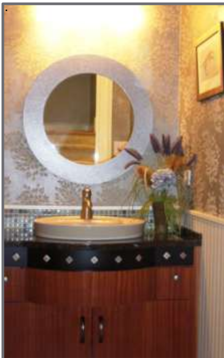
Glass tiles add accent to the custom vanity and coordinate with the backsplash detail