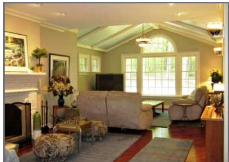
Blue area carpets were selected to keep with the Coastal color scheme, the walls are finished with Nantucket beige paint.