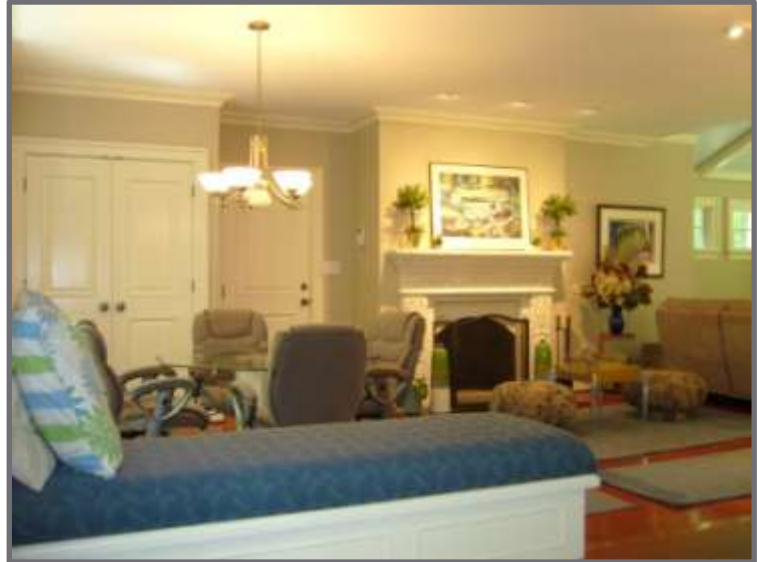
A custom bench seat was designed to separate the Kitchen and Great Room where there is a 6" difference in floor levels.

The home owners wanted a Mediterranean/Coastal design giving their extensive travels, love and appreciation of Greek & Roman classical architecture and Chesapeake Bay boating lifestyle. Greek Revival crown moldings, window and door frames, accessories from Athens, Santorini, Mykonos, Rome and Venice with a neutral color scheme lends a coastal feel to the newly remodeled home.